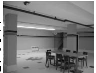
Inside the newly renovated quarters of the Food Pantry.

a meeting room, additional storage, and a large open meeting area for community use. The heating system has been replaced and new windows have been installed. The renovation also includes new stairs connecting the basement to the building’s first floor entryway, new sheetrock and paint, and bright, new linoleum tile floors.