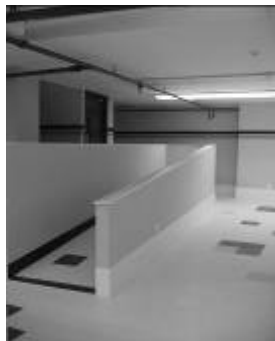
Another view of our beautiful new floor!

The renovation work began in February 2008. The entire basement level of the Community Action Program Center on 134 Center Street in Mamaroneck was stripped to the studs. The new layout includes a dedicated pantry storage room,